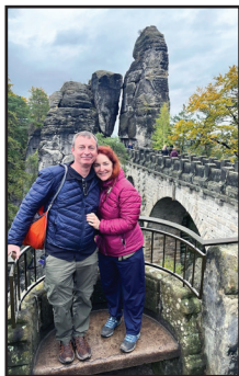
Saxon Switzerland National Park - Bastei Bridge