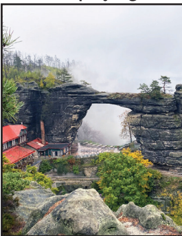
Bohemian Switzerland National Park - Sandstone Arch